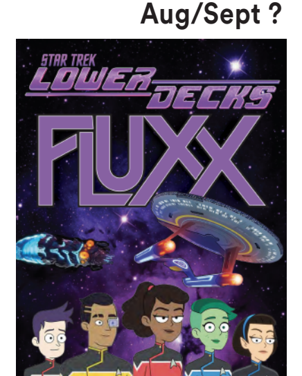
LOO-138 Star Trek Lower Decks Fluxx

It's a spoof of all your favorite detective stories! The Keepers include clues to the murder, scenes of the crime, weapons, suspects, and a host of classic detectives. Includes 9 different card types - including Secrets!